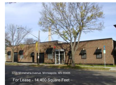
3709 Minnehaha Avenue, Minneapolis, MN 55406 For Lease - 14,400 Square Feet